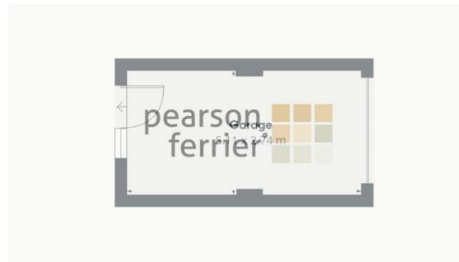
Floor 0 Building 2